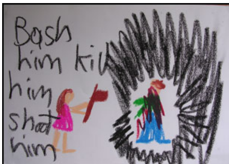
Seven's drawing of 'the father'

L: I remember that when we first started working together telling your story through art was also very important - this work used very different art forms.