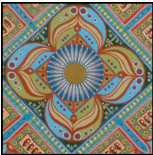
The centre of a mandala