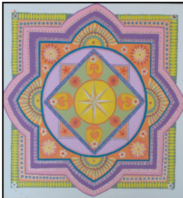
Most recent mandala colour scheme

Talking about colour, this is a really weird part of the mandala process. When I am initially drawing the patterns of the mandala, I see the finished colours, or at least the colour scheme. This doesn't vary over the time it takes to paint it – some small things might change, but basically the colour scheme I see as I am drawing is the colour scheme I will finish with.