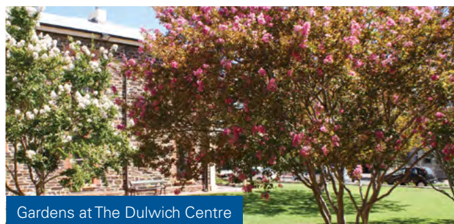
Gardens at The Dulwich Centre