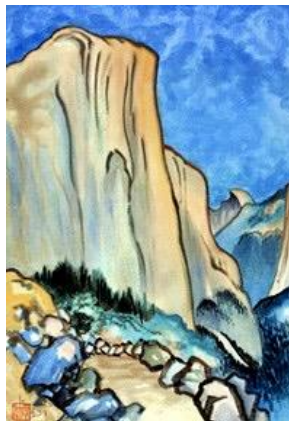
(Chiura Obata “El Capitan”, 1931)

“My grandparents, teachers and backpacking friends taught me that it’s about making it through, taking things slowly, being consistent and saving your energy. I still knit, sew, read books, and make drawings even though I live outside. My friends appreciate my artwork. It helps them remember things they’ve done. Chiura Obata’s images of Yellowstone and the Sierras are very inspiring. We live in such a beautiful place.”